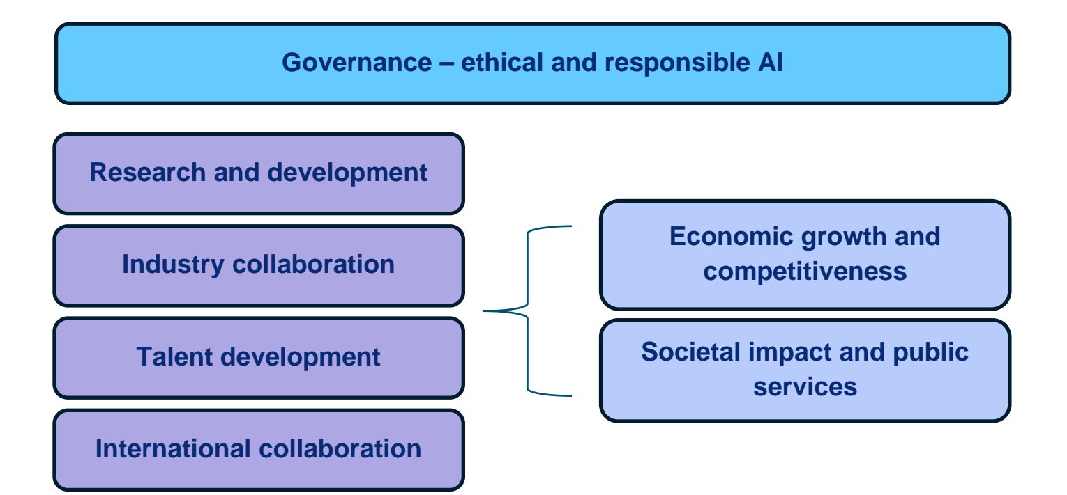
Figure 3.0 - Summary of themes from national AI strategies